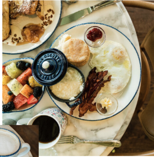
Wendy enjoyed grits every morning at The Emporium Kitchen and Wine Market.

Wendy started each day of her stay with coffee and country cooking at Emporium. "The joy of waking up, grabbing a cup of coffee, and smelling the freshly baked breads and pastries reminded me of Paris," Wendy says. She and Colin tried more than just the sweet treats at this all-day eatery though, instead opting to try a Southern delicacy they'd be hard-pressed to find back home in NYC: grits. "For breakfast, we had grits and eggs," she says. "We had breakfast and dinner at Emporium and really loved the comfort-food touch." The restaurant offers all kinds of elevated fare for dinner—think rabbit ragout with house-made pappardelle, moules frites, and rotisserie chicken with potato purée and farmer's market vegetables—but Wendy and Colin stuck with the Southern staple and feasted on bourbon-brined pork chops with cane water grits and Brussels sprouts.