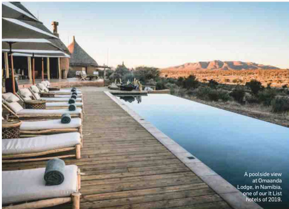
A poolside view at Omaanda Lodge, in Namibia, one of our It List hotels of 2019.